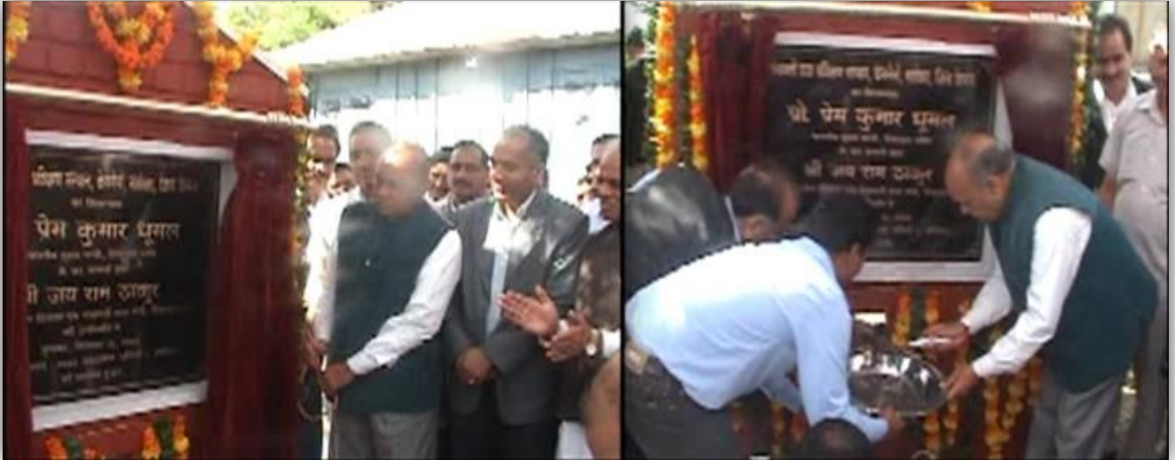
Prof. Prem Kumar Dhumal, Honourable Chief Minister, Himachal Pradesh laid foundation stone of new complex of Panchayati Raj Training Institute at Mashobra, on 16th September 2009.

The Honourable Chief Minister of Himachal Pradesh, Prof. Prem Kumar Dhumal laid the foundation stone of new administrative complex of Panchayati Raj Training Institute at Mashobra; on 16 th September 2009. The construction work of this new administrative complex has been started under the supervision of Himachal Pradesh State Industrial Development Corporation.